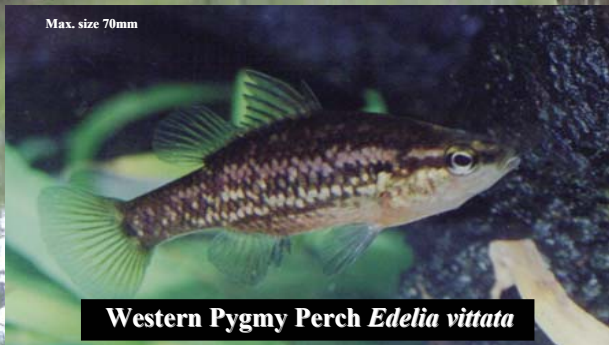
Western Pygmy Perch Edelia vittata