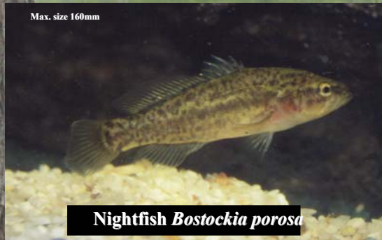
Nightfish Bostockia porosa