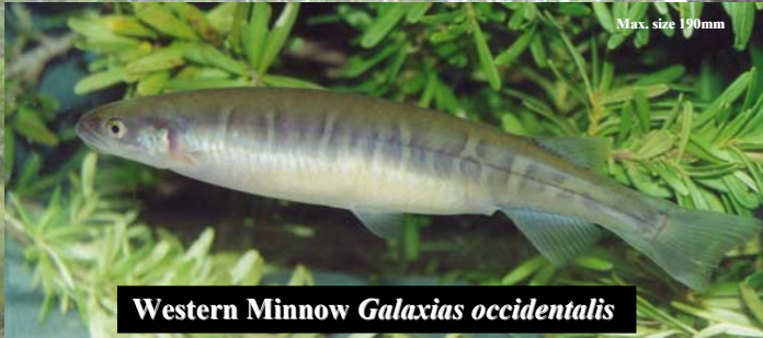
Western Minnow Galaxias occidentalis