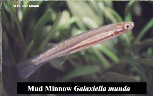
Mud Minnow Galaxiella munda