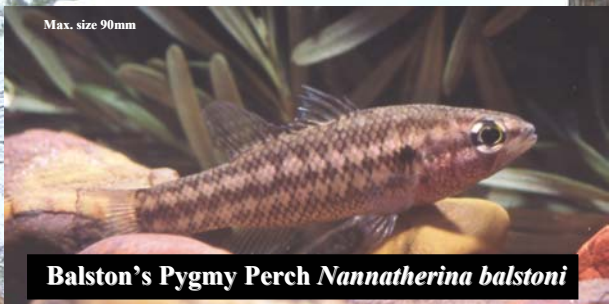
Balston's Pygmy Perch Nannatherina balstoni

The western minnow, western pygmy perch and nightfish are widespread throughout the river, while Balston's pygmy perch and the mud minnow are restricted to the upper catchment.